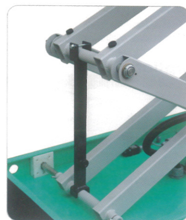
Safety bean, for use, during maintenance.