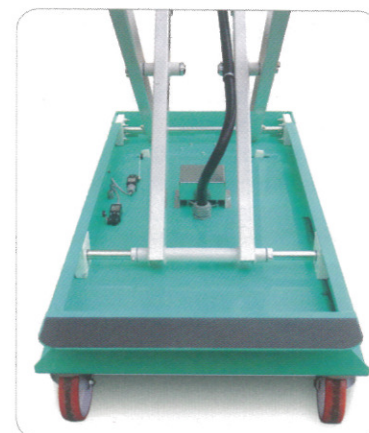
Functional chassis design for easy cleaning.